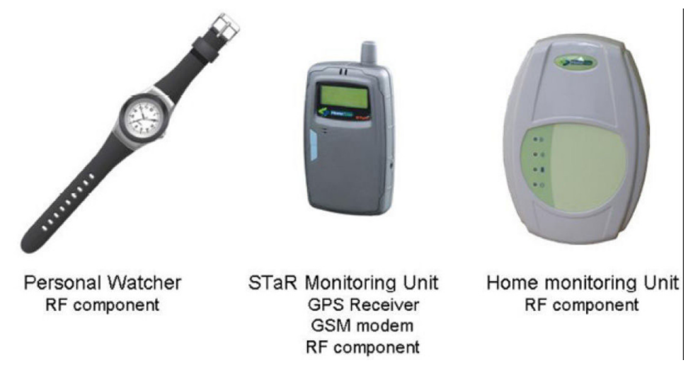
Figure 3 Elements of the location kit to be used in the project.

The GPS is programmed to obtain locations every 10 seconds when the tracked person is outside the home. The data collected in Israel and in Germany are sent by GPRS protocol to a control unit at the Hebrew University of Jerusalem where it is stored on the project's server. Family members of patients in the study group will be able to log onto the project web site to locate their family member in real time.